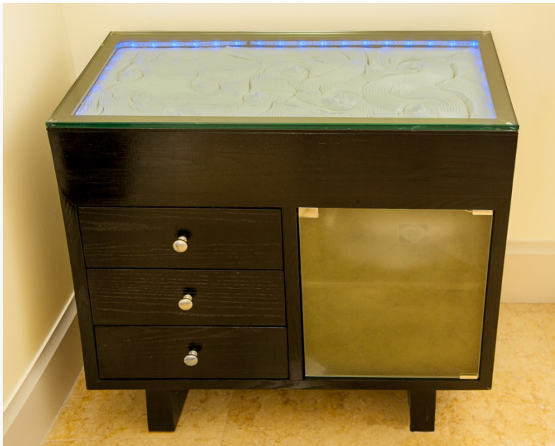
Lit Buffet by Barry Friedman

This inspired him to use plaster and incorporate it in an unconventional way to create art. He began making beautiful textural pieces enhanced by the use of color, applied with an airbrush, designing wall art as well as furniture.